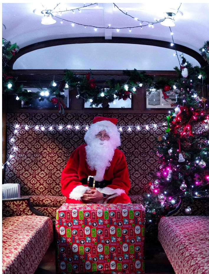
Father Christmas awaits...