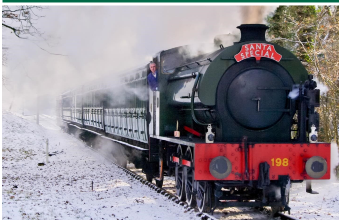
Santa specials run throughout December